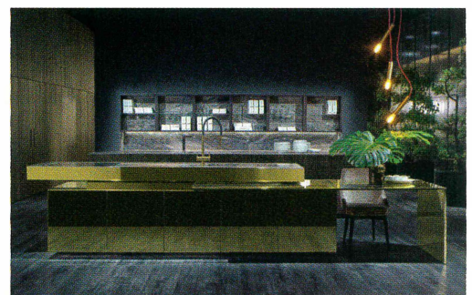
furniture at Galerie May; kitchen from Rossana; four-column 18-section radiator from Castrads, painted in off black by Farrow & Ball