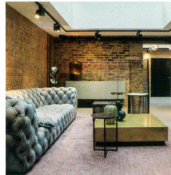
From top: lighting by Magic Circus at Poliform; Linley's 'Vortex' cabinet; Silvera showroom at the French Design Trail; shutters from the New England Shutter Company;